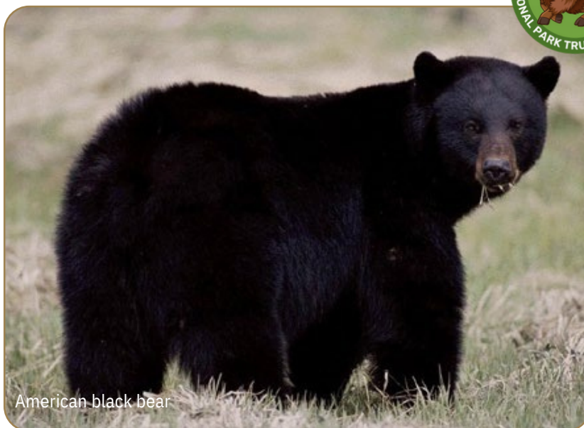
American black bear

Learn to identify an American black bear track on your own! Make your own stamps of three different predators found in Smoky Mountains National Park using the guidelines on the following page.